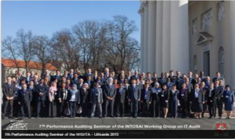
7th Performance Auditing Seminar of the INTOSAI Working Group on IT Audit 7th Performance Auditing Seminar of the WGITA - Lithuania 2013