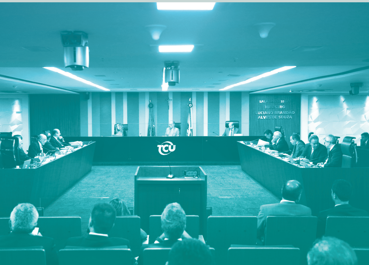
Judgment at TCU