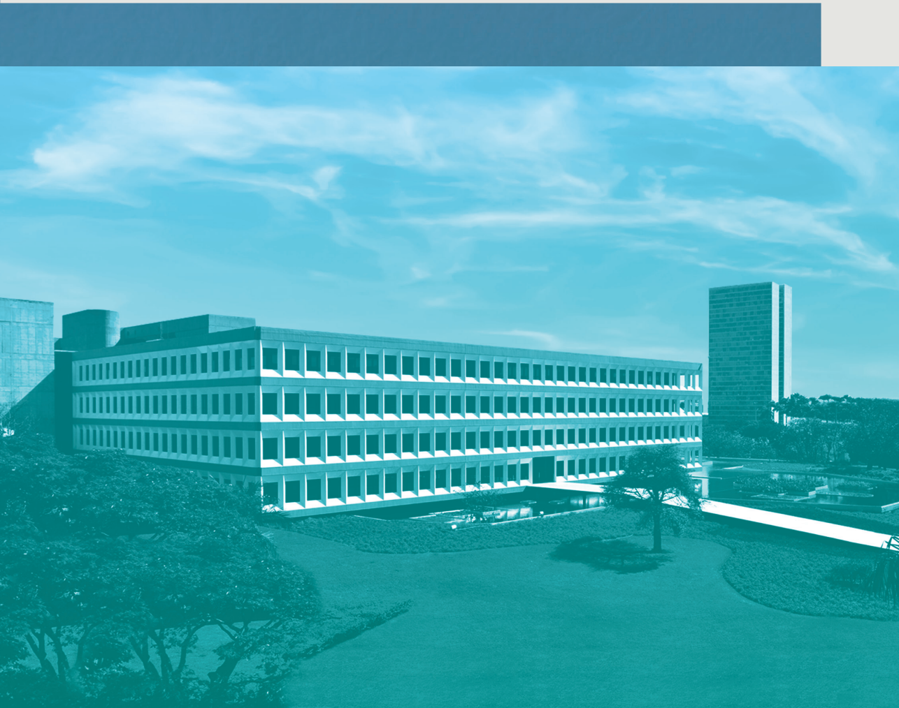
Federal Court of Accounts (TCU)